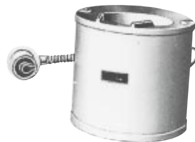
P-15 and P-50 with flexible conduit and 3-heat switch (AC only).