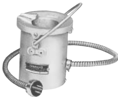
P-8 with 3 ft. cord and grounded plug.