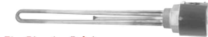
E1 — Dimensions (Inches)