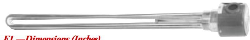
E1 — Dimensions (Inches)