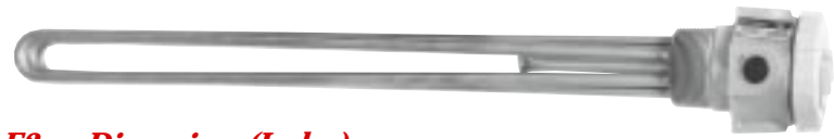
E2 — Dimensions (Inches)