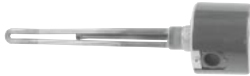
E1 — Dimensions (Inches)