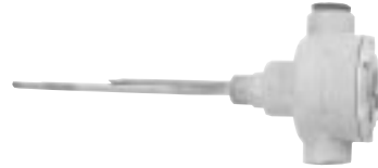
E2 — Dimensions (Inches)