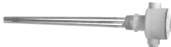
E2 — Dimensions (Inches)