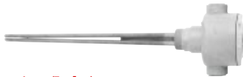
E2 — Dimensions (Inches)