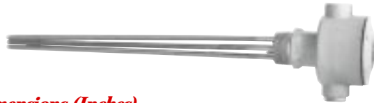
E2 — Dimensions (Inches)