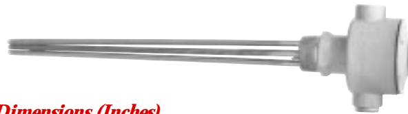
E2 — Dimensions (Inches)