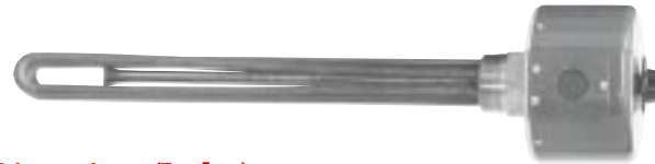
E1 — Dimensions (Inches)