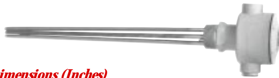
E2 — Dimensions (Inches)