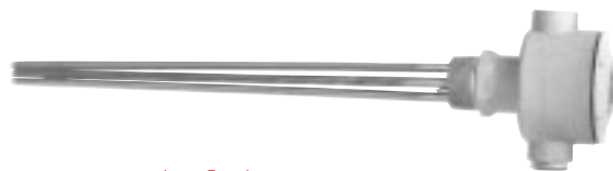
E2 — Dimensions (Inches)