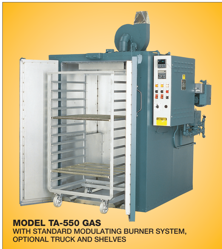
MODEL TA-550 GAS WITH STANDARD MODULATING BURNER SYSTEM, OPTIONAL TRUCK AND SHELVES