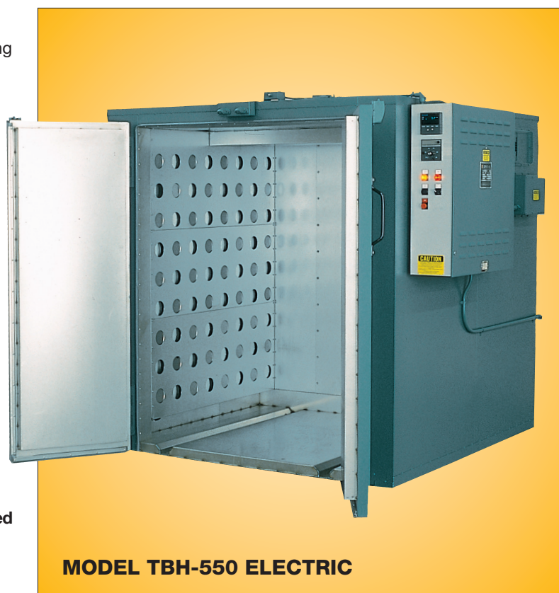
MODEL TBH-550 ELECTRIC