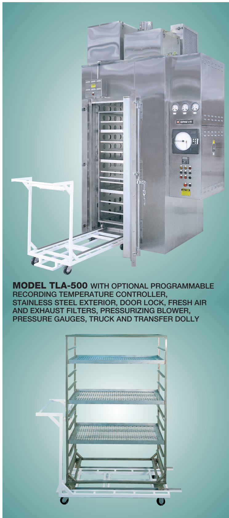
MODEL TLA-500 WITH OPTIONAL PROGRAMMABLE RECORDING TEMPERATURE CONTROLLER, STAINLESS STEEL EXTERIOR, DOOR LOCK, FRESH AIR AND EXHAUST FILTERS, PRESSURIZING BLOWER, PRESSURE GAUGES, TRUCK AND TRANSFER DOLLY