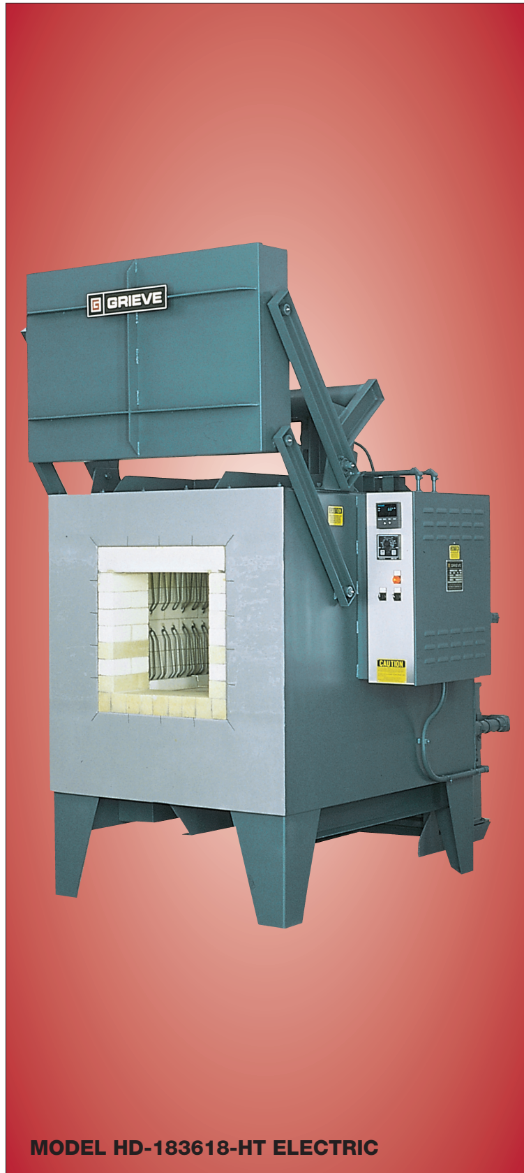
MODEL HD-183618-HT ELECTRIC

Specifications Subject to Change Without Notice Copyright The Grieve Corporation All Rights Reserved Printed in U.S.A. 6/07