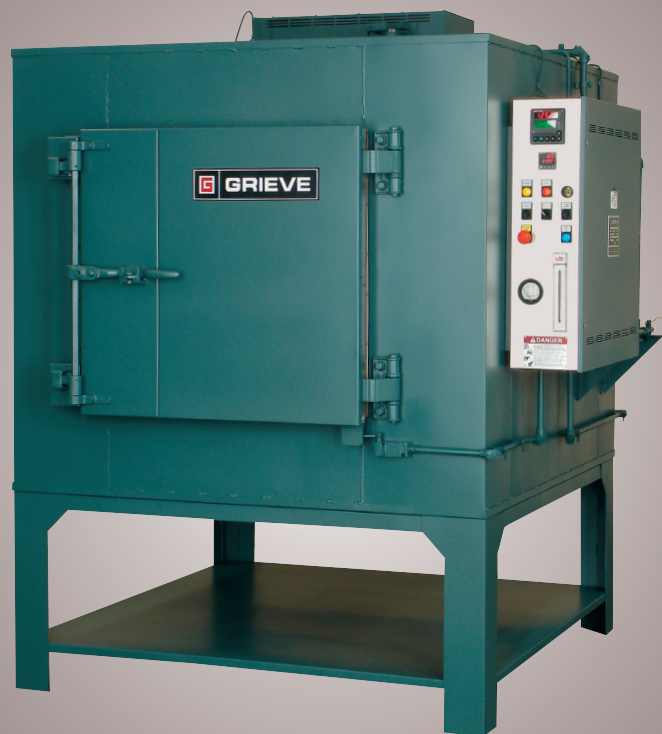
MODEL IA-1250 WITH OPTIONAL PROGRAMMABLE TEMPERATURE CONTROLLER, AUTOMATIC DOOR SWITCH AND 24" INTEGRAL OVEN LEGS

1050°F AND 1250°F FRONT-TO-BACK HORIZONTAL AIR FLOW INERT ATMOSPHERE OVENS