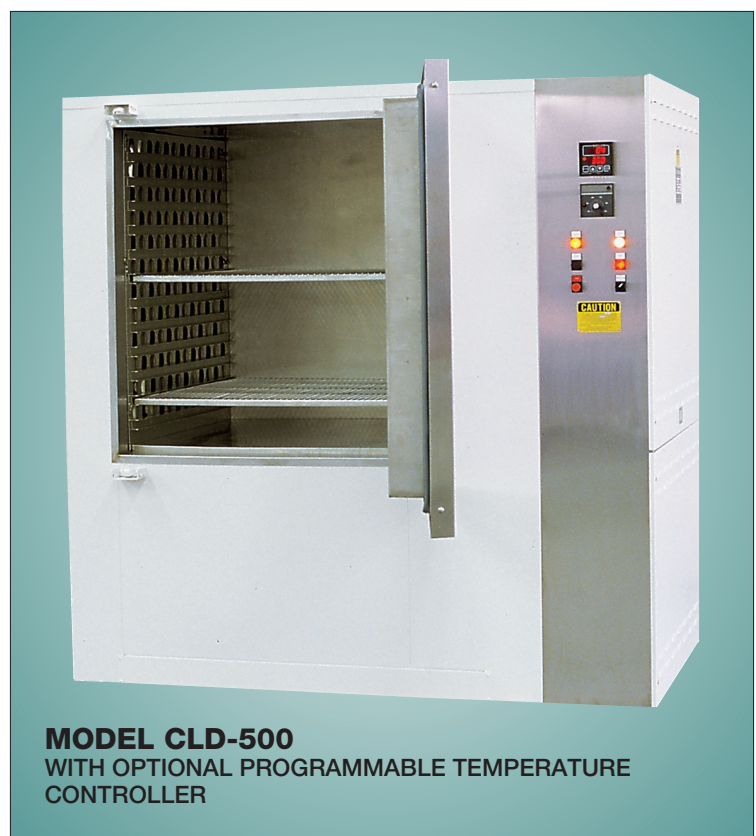
MODEL CLD-500 WITH OPTIONAL PROGRAMMABLE TEMPERATURE CONTROLLER