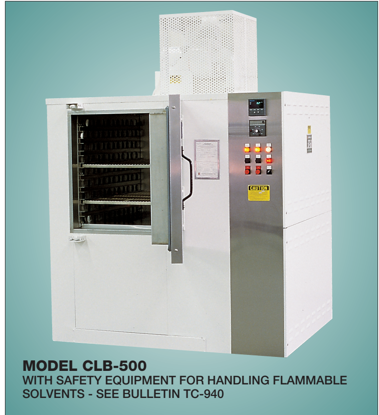
MODEL CLB-500 WITH SAFETY EQUIPMENT FOR HANDLING FLAMMABLE SOLVENTS - SEE BULLETIN TC-940