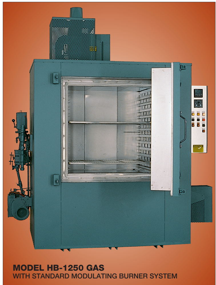
MODEL HB-1250 GAS WITH STANDARD MODULATING BURNER SYSTEM