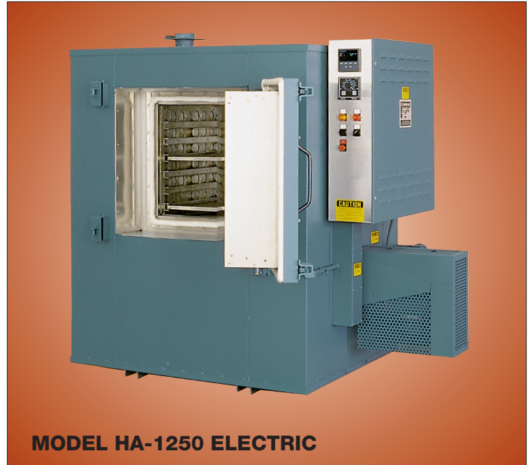
MODEL HA-1250 ELECTRIC