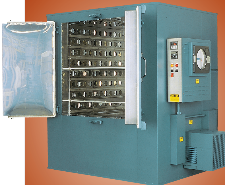
MODEL HC-850 ELECTRIC WITH OPTIONAL PROGRAMMING TEMPERATURE CONTROLLER AND RECORDING THERMOMETER