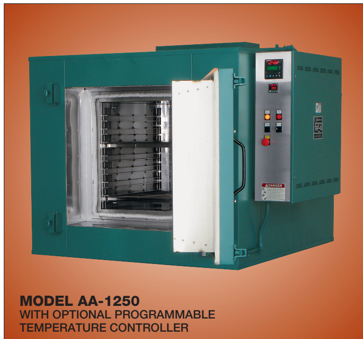
MODEL AA-1250 WITH OPTIONAL PROGRAMMABLE TEMPERATURE CONTROLLER