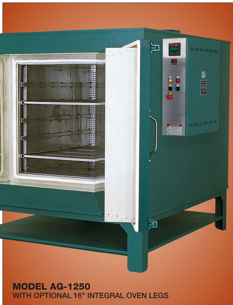
MODEL AG-1250 WITH OPTIONAL 16" INTEGRAL OVEN LEGS