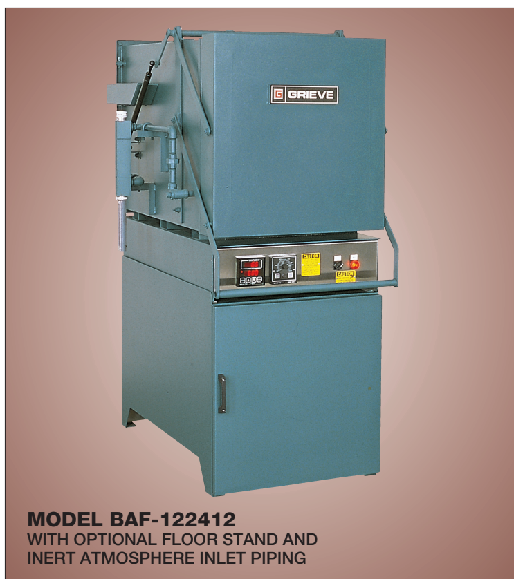
MODEL BAF-122412 WITH OPTIONAL FLOOR STAND AND INERT ATMOSPHERE INLET PIPING