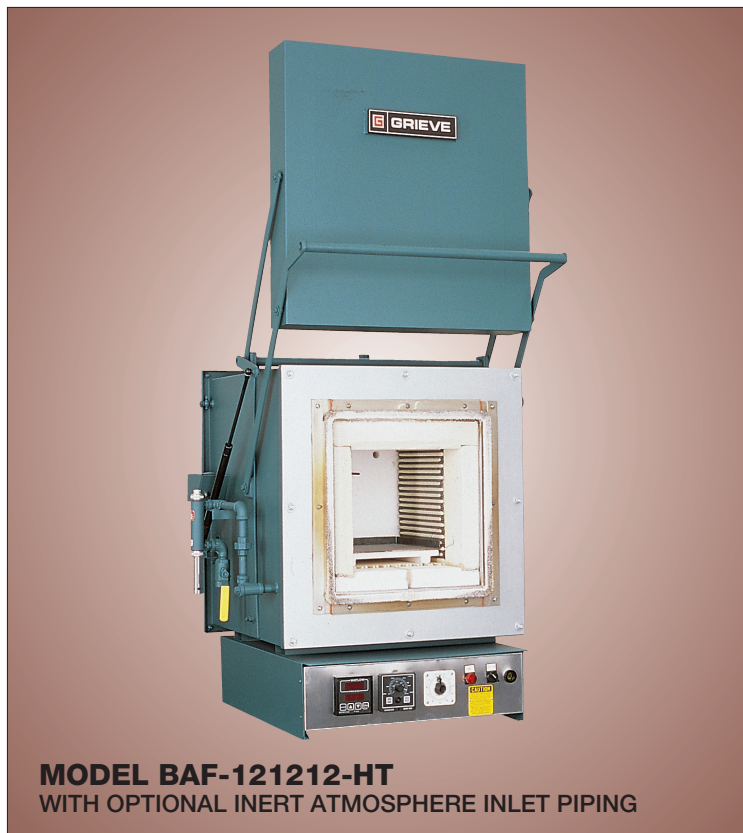
MODEL BAF-121212-HT WITH OPTIONAL INERT ATMOSPHERE INLET PIPING

INERT ATMOSPHERE ELECTRIC HEAT TREATING FURNACES