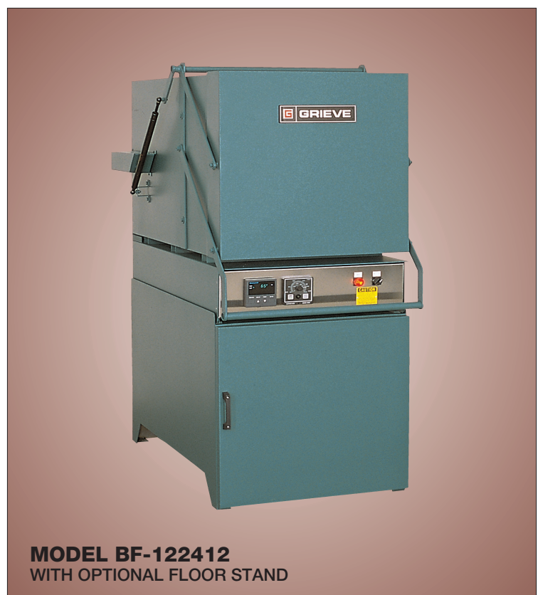
MODEL BF-122412 WITH OPTIONAL FLOOR STAND