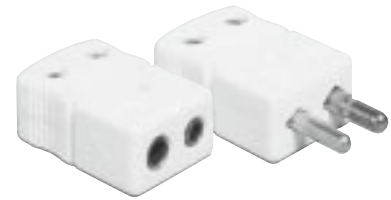
NHX — Extra Heavy Duty High Temperature Ceramic Connectors