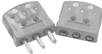
OTP — Thermocouple and RTD Connectors