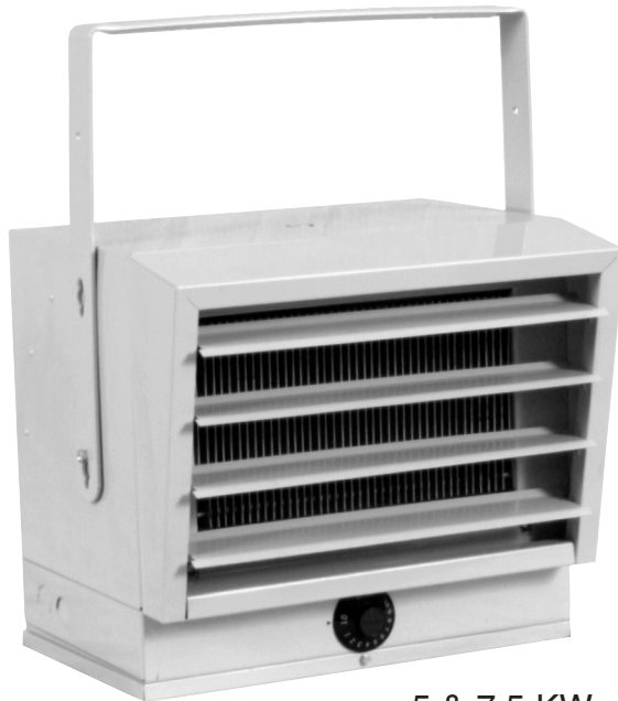
5 & 7.5 KW