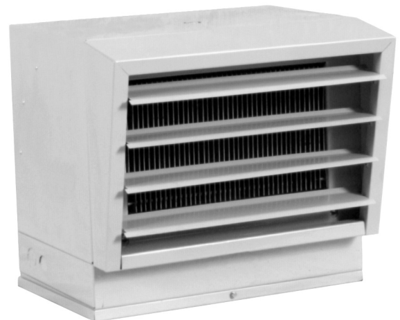
10 & 30 KW